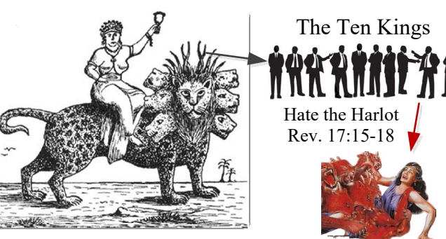
The Great Harlot An Idolatrous Religious System

1. Islam is the Harlot idolatrous religious system whose cup is full of the blood of the saints.